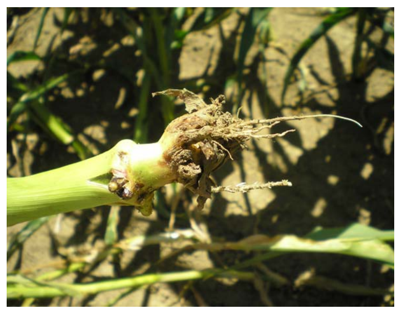
Root damage caused by WCR larvae (above) and subsequent plant lodging (below).